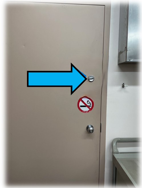
Exterior Kitchen Door