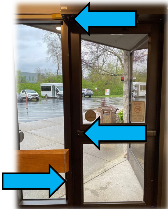
North East Exterior Door